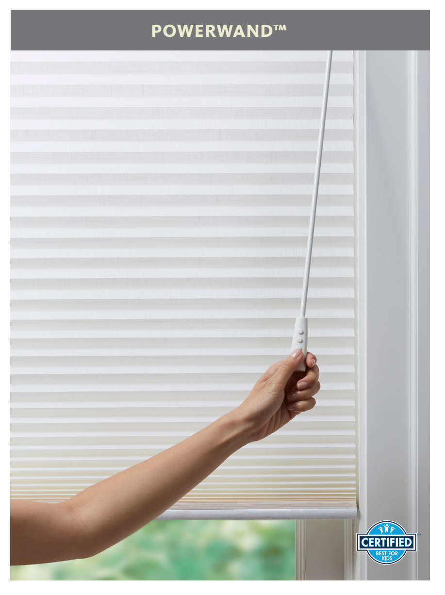
The PowerWand<sup>™</sup> lifts and lowers shades with the touch of a button. PowerWand is affordable and rechargeable, too.

Control all your motorized Honeycomb Shades in one room. Choose from a variety of battery-operated systems to raise or lower shades with a few simple taps on your device.